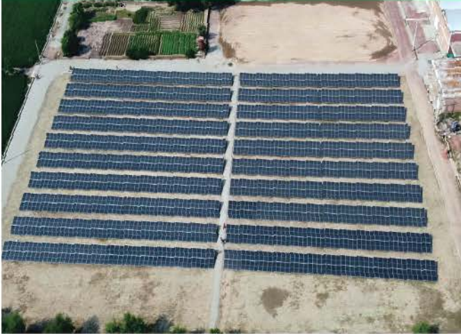
Iqbal Rice Mills, Chiniot