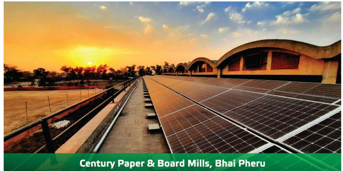
Century Paper & Board Mills, Bhai Pheru