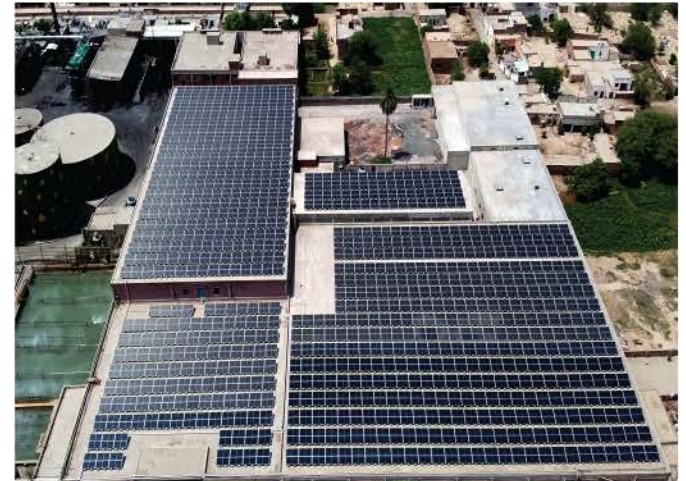
Al-Hilal Industries, Multan