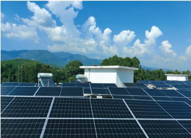
Ministry of Foreign Affairs - GIZ, Islamabad