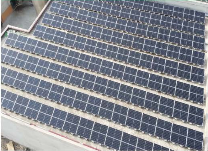
Adam's Milk Foods, Sahiwal