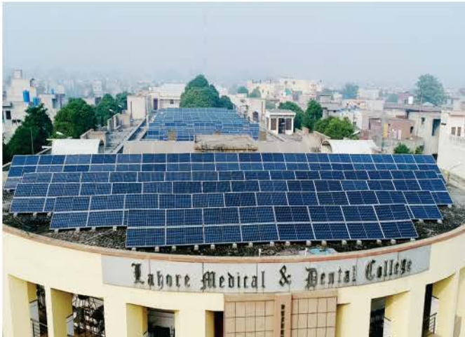
Lahore Medical & Dental College, Lahore