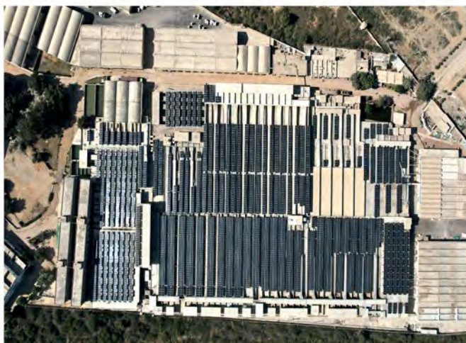
Nagina Group, Lahore