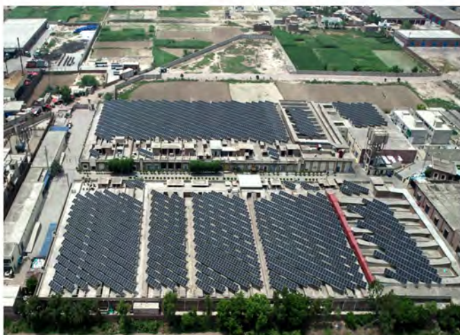
JK Group, Faisalabad