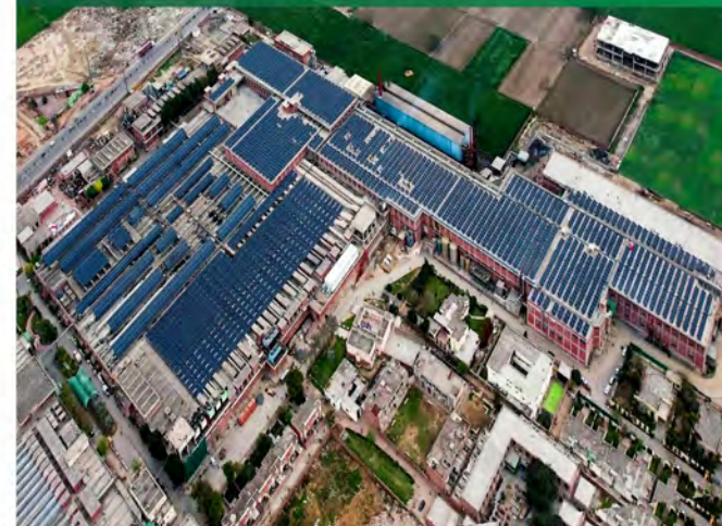
Diamond Fabrics Ltd, Sheikhpura